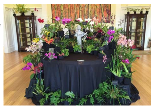
Display from 2016 Show

The 2017 Annual Orchid Show will be held at the Coastal Georgia Botanical Gardens on April 28 - 30, 2017. We have four vendors committed and working on more. The judges should be tied up by our meeting.