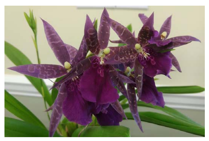
Oncidium 2nd - Bratonia Dark Star 'Darth Vader'