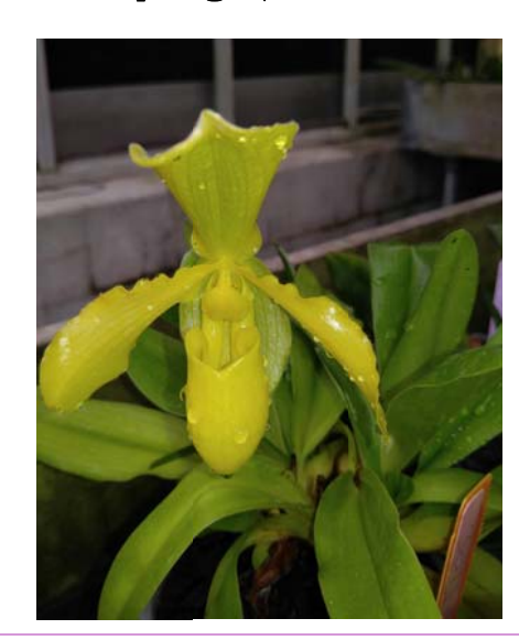
The Deep South Orchid Society Website — www.DeepSouthOrchidSociety.com