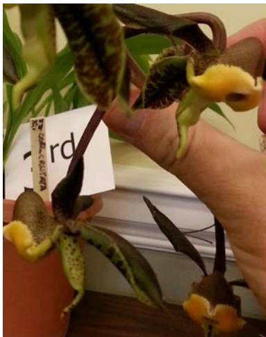
Catasetum gnomus (not a NoID but no tag) Brittany Lowery