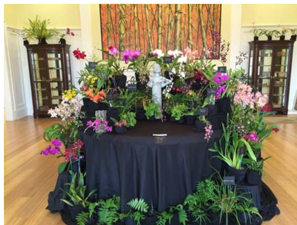
Display from 2016 Show

The 2017 Annual Orchid Show will be held at the Coastal Georgia Botanical Gardens on April 28 - 30, 2017. Start making your plans, start getting ready, start deciding what job you want, why just go ahead and get everything started!