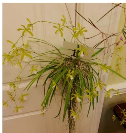
Encyclia tampensis var. alba

Speaking of repotting!! FREE PLANT OPPORTUNITY! Saturday June 16 th from 10 AM to 2 PM at the CGBG Orchid Greenhouse , there will be an event to help catch up with some much overdue potting needs. Fair warning, if you've put plants there that are not properly labeled as yours and you haven't contributed to their care, these plants will become communal property to be given away to those repotting them, used as raffle plants, etc. If you wish to retain these plants, it's your responsibility to go to the greenhouse, get them labeled and help others with their care.