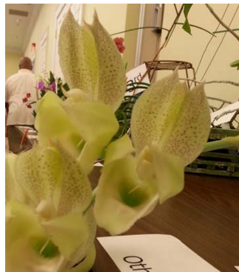
Catasetum X tapiriceps (nat. hybrid of C. pileatum and C. macrocarpum ) (Best in Show) - Jim Keplinger