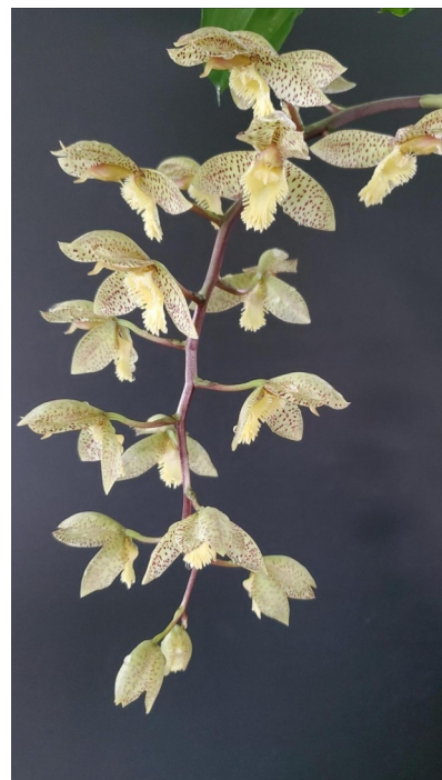
Catasetum Russ Wood