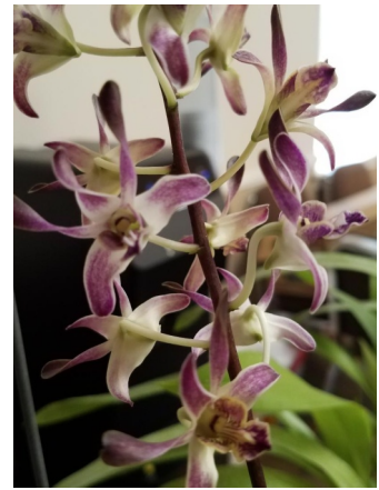
Dendrobium Blue Seas (Blue Twist x antennatum), Owner: Kim Owens