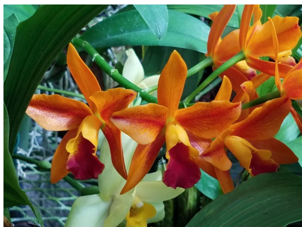
Pot. Netrasiri Starbright 'NN'

We had our first taste of cooler weather during Tropical Storm Ian. Do you have a place for all your orchids? Consider our greenhouse.