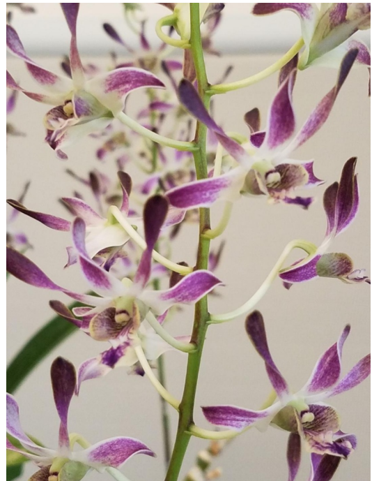
Dendrobium Owner: ?