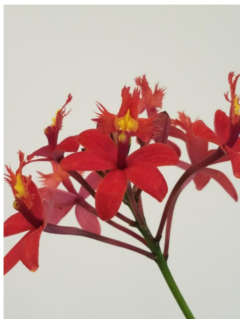
Epidendrum, Owner: ?

You see TBD on the DSOS Meetings At A Glance. Do you have a suggestion to change TBD into an activity/speaker? See any of the board members with your suggestions.