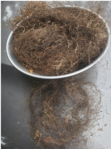
Picture 1. Dead Spanish Moss

This is the last installment of the orchid growing tips from the July meeting.