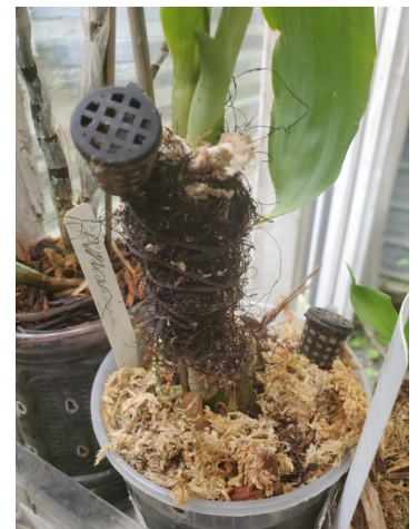
Picture 2. Dead Spanish Moss used as a wrap.