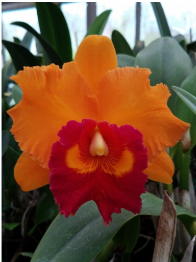
Rlc. Nakornchaisri Delight