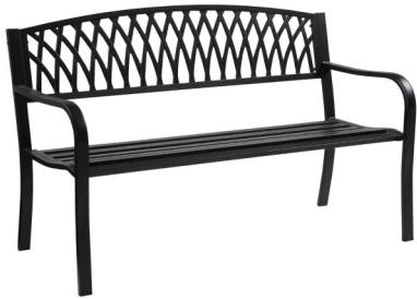
Picture of the Bench Ordered