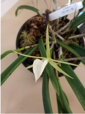
B. Little Stars (nodesa x cordata), Owner: Gavin Wansink

The board met on 14 November 2022. The board is scheduled to meet on 11 December 2022. The time and place TBD.