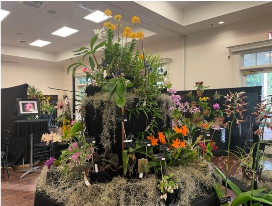
Deep South Orchid Society Display