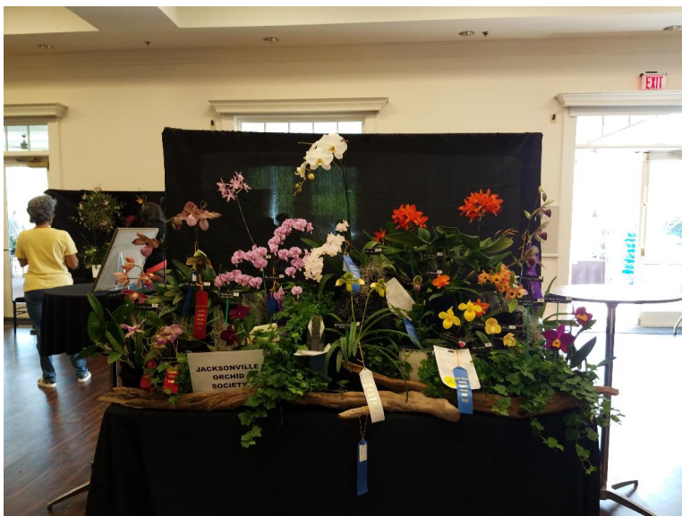
Jacksonville Orchid Society Display