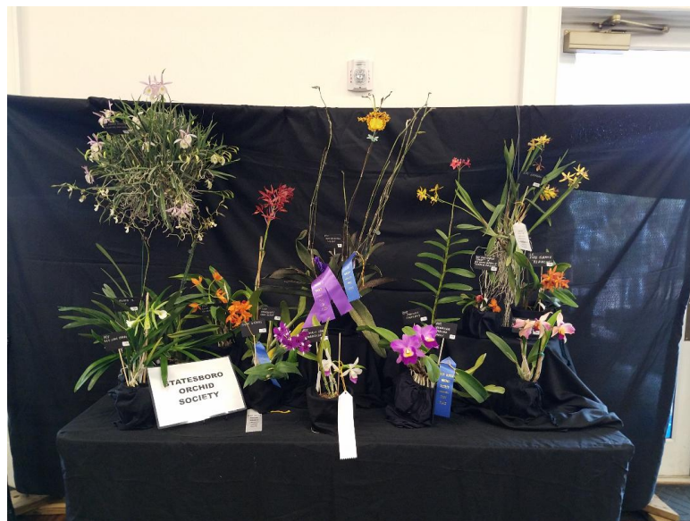
Statesboro Orchid Society Display