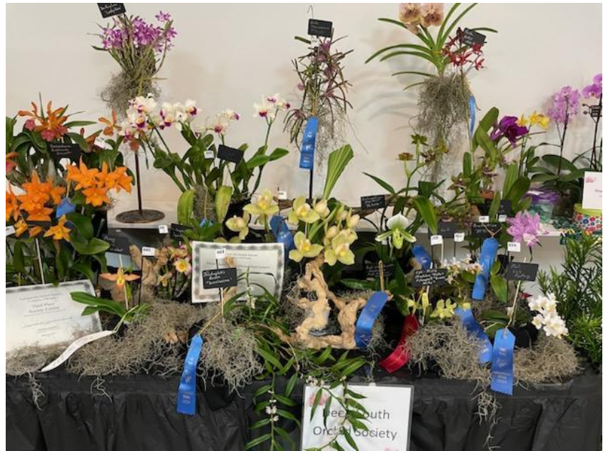
Jaime Yu's Display