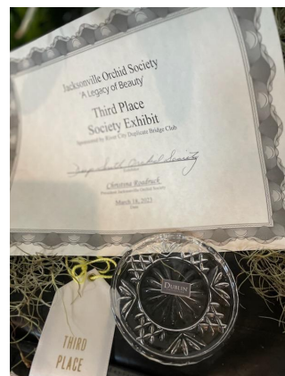
Third Place for Society Exhibit