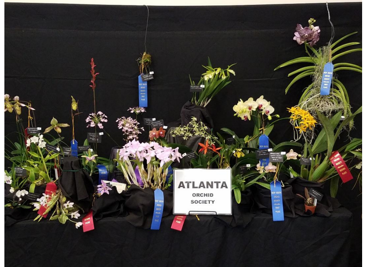
Atlanta Orchid Society Display