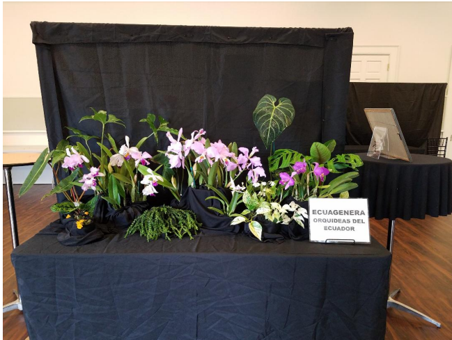
Ecuagenera Orquideas del Ecuador Display