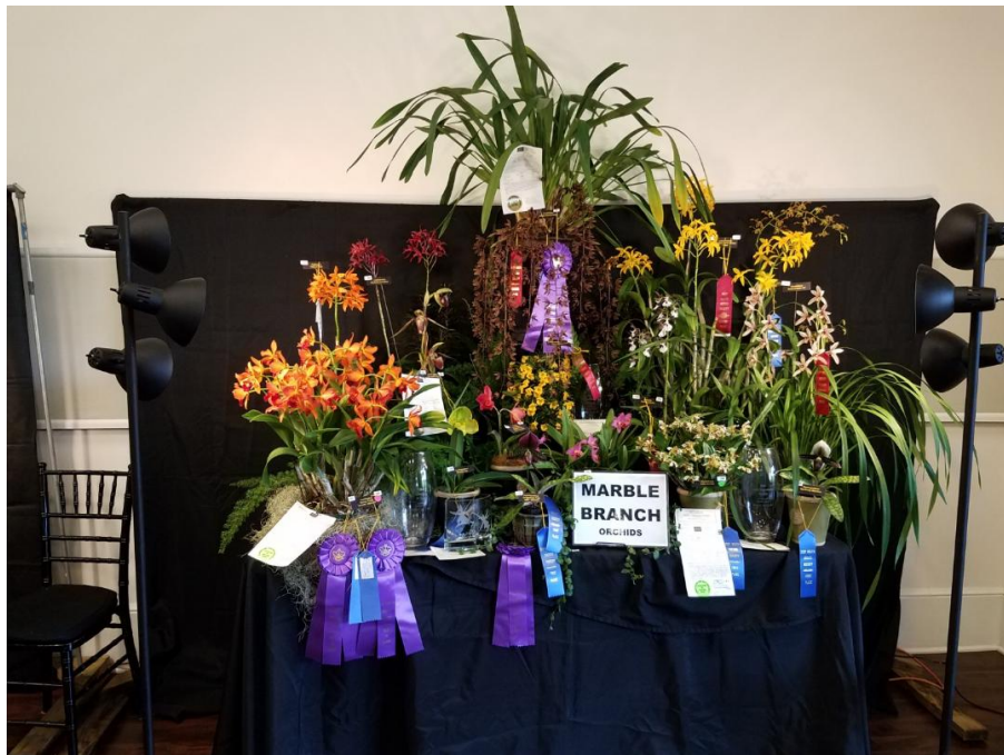
Marble Branch Farms