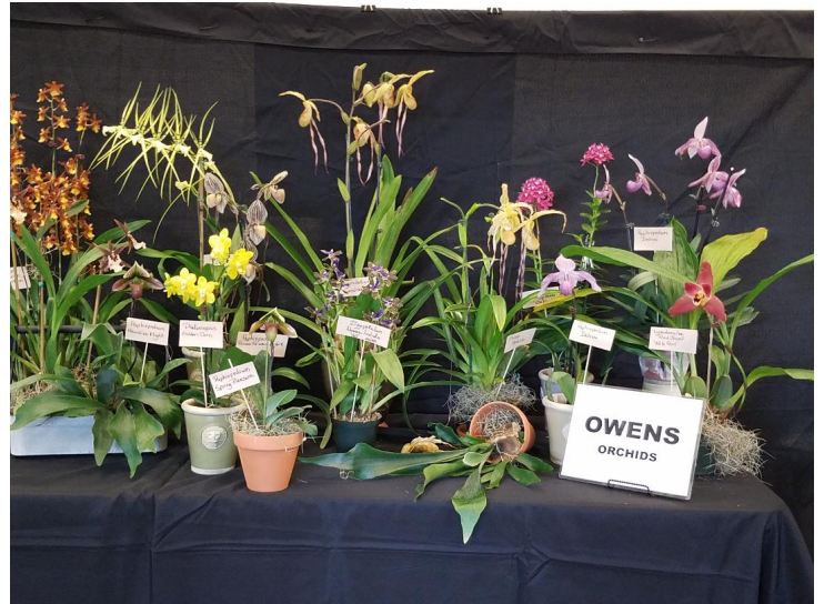
Owens Orchids Display