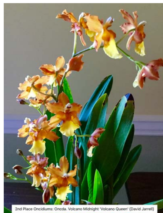
2nd Place Oncidiums: Oncda. Volcano Midnight 'Volcano Queen' (David Jarrell)