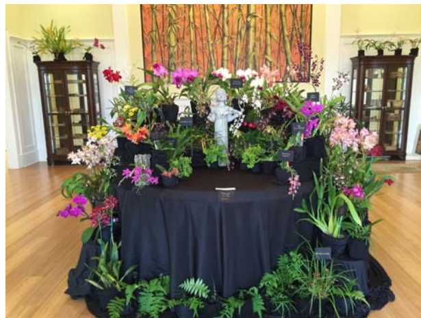
Display from 2016 Show

The 2017 Annual Orchid Show will be held at the Coastal Georgia Botanical Gardens on April 28 - 30, 2017. Start making your plans, start getting ready, start deciding what job you want, ... why don't you just go ahead and get everything started!