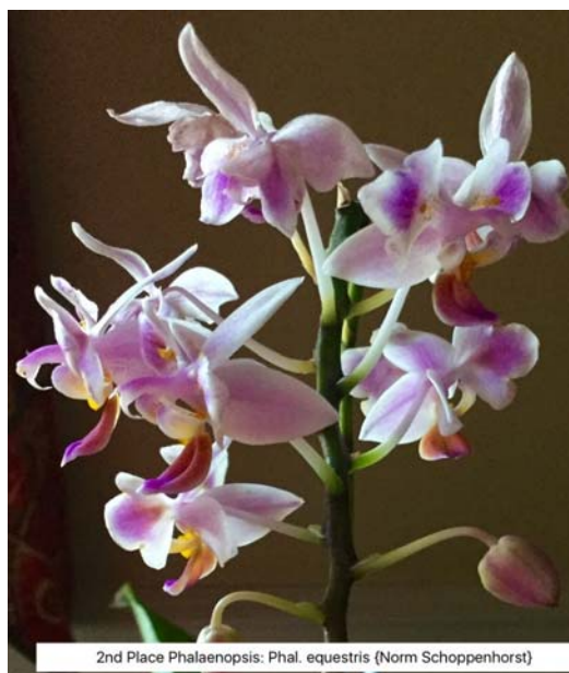
2nd Place Phalaenopsis: Phal. equestris (Norm Schoppenhorst)