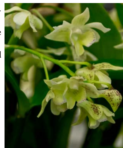
1st Place Dendrobium-Jimmy Yu