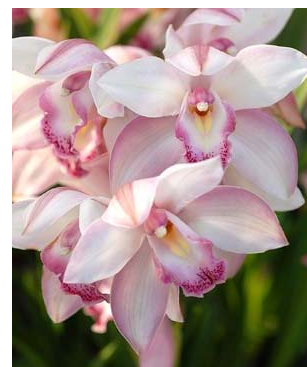
Cymbidium Magic Mountain

Plants should be putting on a spectacular show this time of year. Adjust all staking and twists and be on the lookout for aphids, slugs and snails. Give adequate water because flowering strains the plants. As new growths appear later, increase the nitrogen level in the fertilizer. Should a plant look healthy but not be blooming, try increasing the light during the next growing season. The number-one reason for no flowers is lack of light.