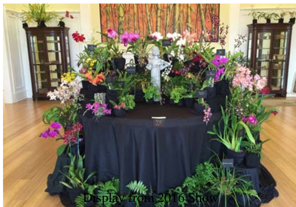
Display from 2016 Show

It will take the help and support of every member to make the show a success!